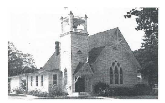
SALEM United Methodist Church 2018

12 High Street, Brookeville, Maryland 20833